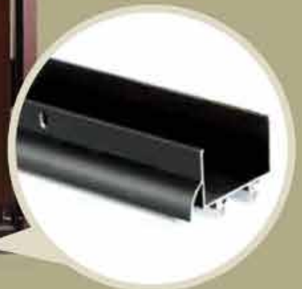
Alumnum Door Shoes with Drip Cap