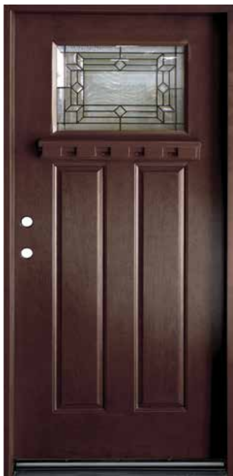
FM300A Dark Walnut