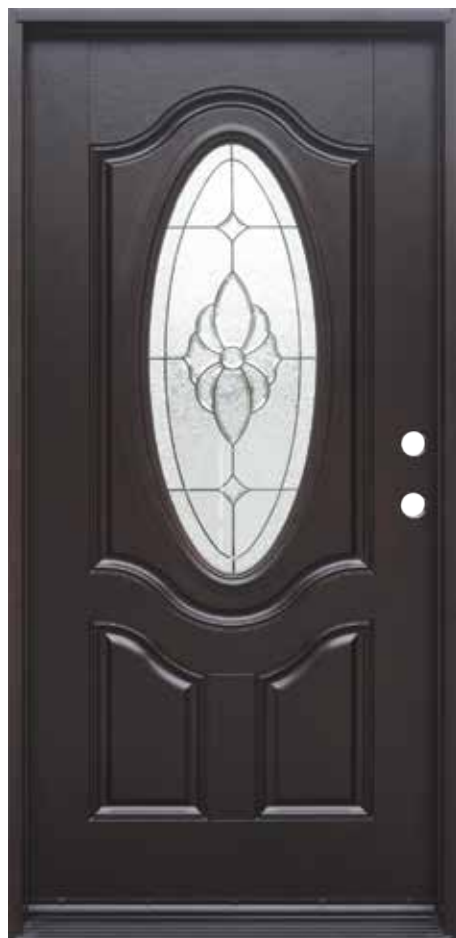
FM800 Dark Walnut