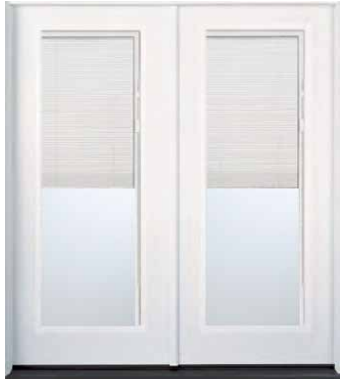
FS110 French Door