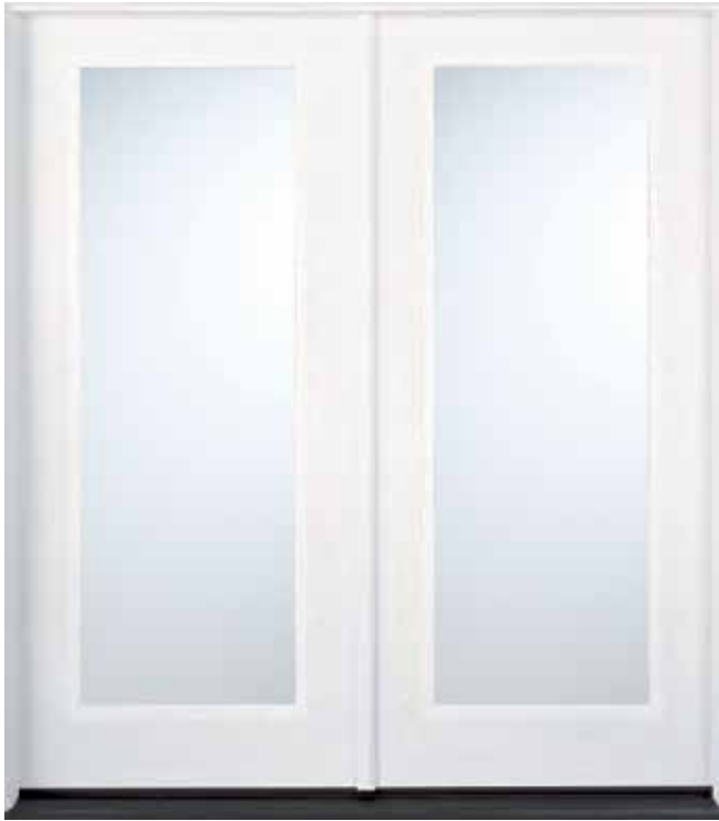
FS100 French Door