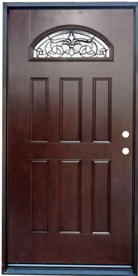
FM285A Dark Walnut