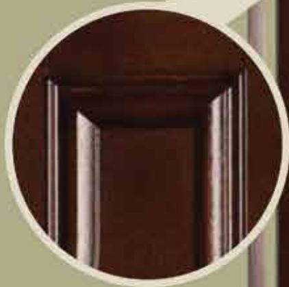
Mahogany Embossed Grain