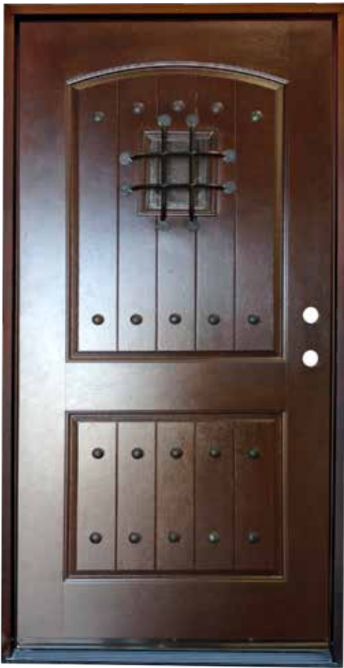
FM200 Dark Walnut